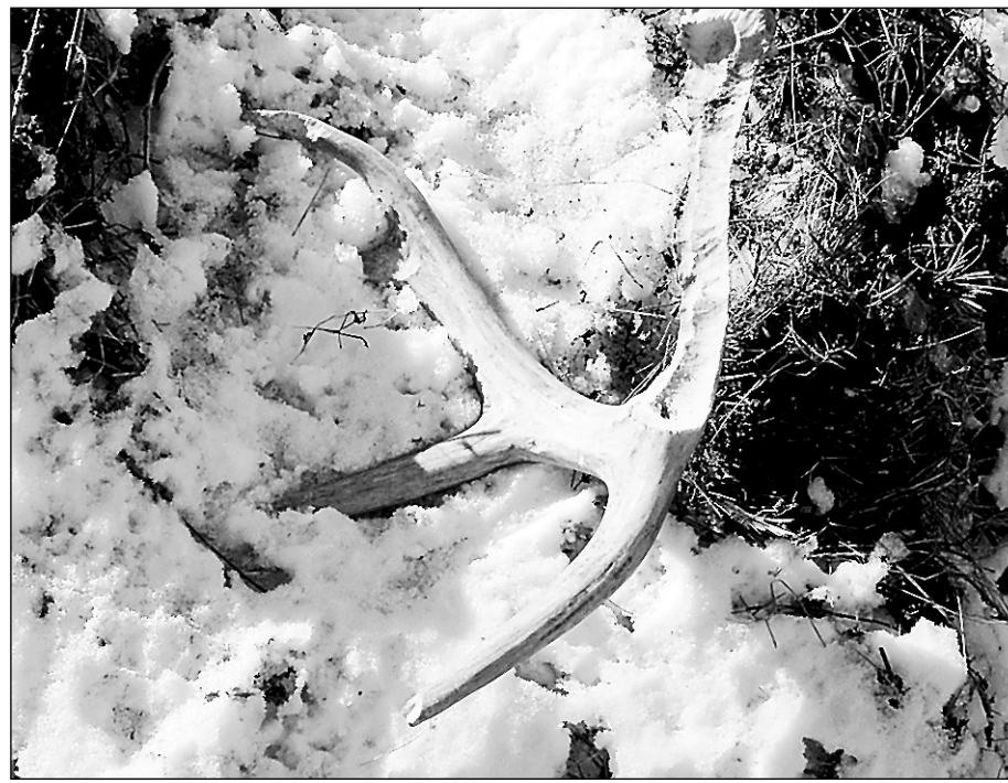
Sheds that have been chewed are a pretty common sight as rodents chew on them to obtain calcium.

It's a known fact that all of the bucks don't drop their racks at the same time. Some of them will begin to lose their racks following the rut, when their hormone levels start to drop.