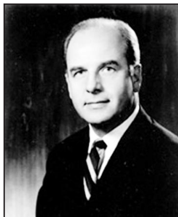
Sen. Gaylord Nelson

When Nelson was at a conference in Seattle in September 1969, he made an announcement. He spread the word of the nationwide grassroots demonstration held for the environment that would take place in the spring of 1970. He encouraged participation, and the news traveled quickly. Almost instantly, Nelson was receiving telegrams, letters, and calls