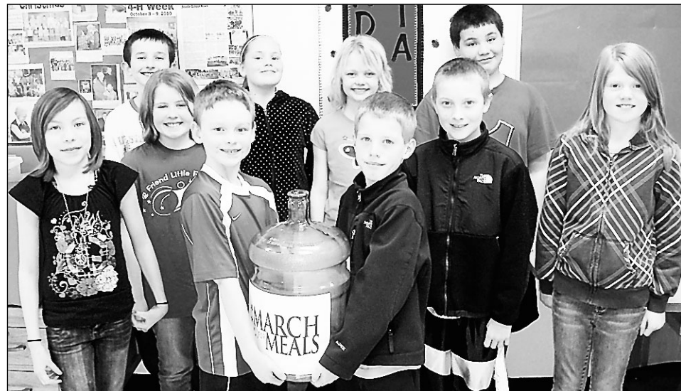
The Beadle Elementary Student Council raised over $120 through a spare change drive. The money will be given to The Center for their March for Meals campaign to end senior hunger. Thank you to everyone who helped with this project. Pictured are students from the Beadle Elementary Student Council.

STARTING TODAY, OPPORTUNITY NO LONGER KNOCKS. IT KICKS DOWN THE DOOR.