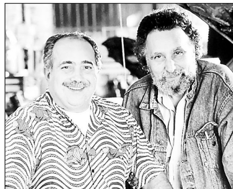
CLICK &amp; CLACK

TOM: In the old days, excessive idling was listed probably because cars ran so rich. Carburetors dumped buckets of gasoline into the cylinders. Some of it was combusted, and some of it wasn't. The gasoline that didn't combust just ran down the walls of the cylinders, and some of it snuck past the