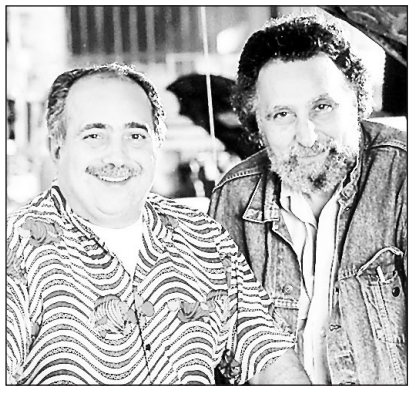
CLICK & CLACK

Dear Tom and Ray: I own a 2008 Honda Civic with 33,000 miles. I have regularly changed the oil and rotated its tires. I also have replaced the air filter on one occasion. Is there any reason for me to succumb to the pressures of the Honda dealer that services my vehicle and have the 30,000-mile service, or am I just better off continuing to change the oil and rotate the tires? Thanks.