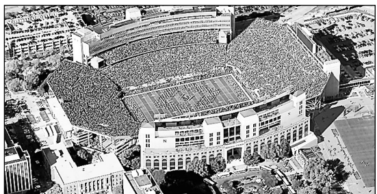
CLARK ENERSON PARTNERS