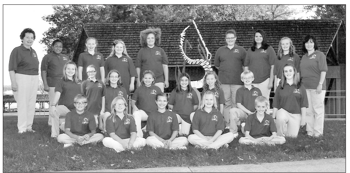
The Yankton Children's Choir will present its final performance of the season at 2 p.m. Sunday at the United Church of Christ in Yankton.