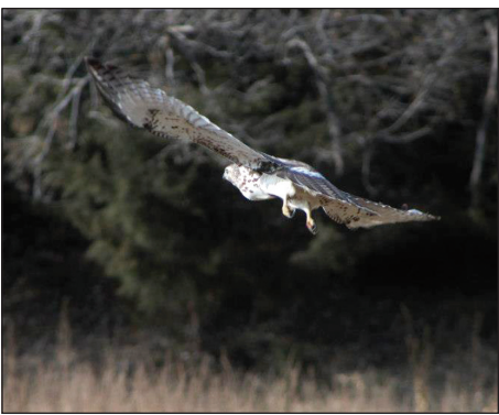
HAVE A PHOTO? Submit it to River City for publication in this space: RiverCity@yankton.net.