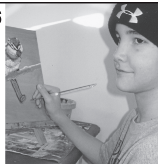
Painting Student at Work

Wildlife Art, Impressionism, Landscapes, Portraits, Flowers & Abstract Choices for Art