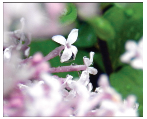
HAVE A PHOTO? Submit it to River City for publication in this space: RiverCity@yankton.net.