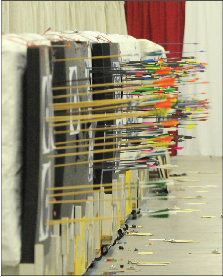
The row of targets at the Easton Complex in Yankton is pelted with targets during Friday's opening round of the International Field Archery Association (IFAA) World Indoors Archery Championships.