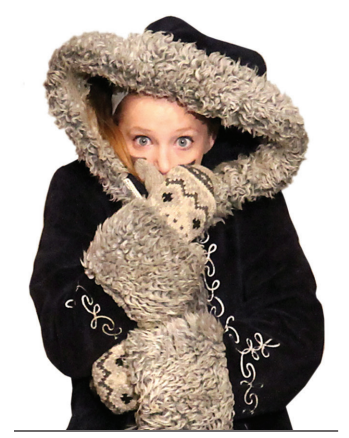
A Look Back At The Images Of Winter