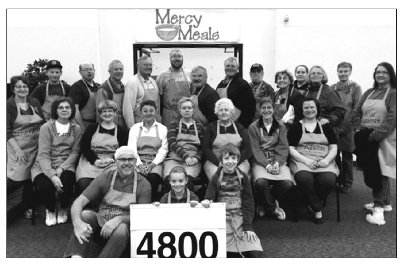
The Yankton First United Methodist Church recently packed 4800 meals at Mercy Meals of Yankton for children in need of our care. To learn more about how you can make a difference, please visit www.mercymealsyankton.org or find us at our Facebook page.