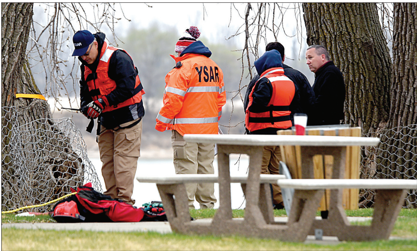
The Yankton County Search and Rescue Dive team was on the scene at Riverside Park Monday in search of a missing 6-year-old boy who fell in the Missouri River Sunday evening. The search, which has been changed to a recovery effort, is using sonar to help identify potential search locations that the dive team.