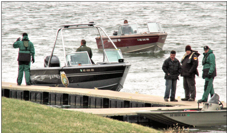
Search crews used the boat docks at the southeast corner of Riverside Park as a base of operations Monday in search of a missing 6-year-old boy who is presumed to have fallen in the Missouri River.