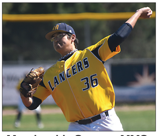
Morningside Sweeps MMC In Baseball Action • 8