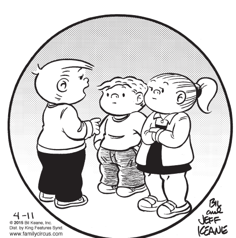
"Let's see which one of us can whisper the loudest.'