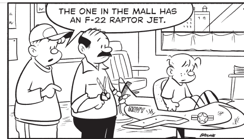
FOR BETTER OR FOR WORSE | LYNN JOHNSTON