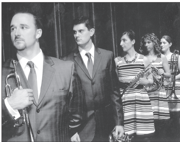
The Alliance Brass Quintet of Chicago performs at the YHS/Summit Activities Center theatre in Yankton April 24.