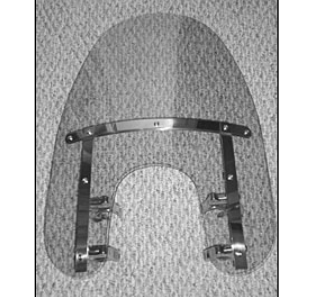
HD Quick Detach Windshield for Dyna 2006 & up, fits 49MM tubes. Like new, $250. (605)661-2308.

1315 Drivers Truck Driver wanted. Small family owned company, Norfolk area based. All miles paid off speedometer. Top wages paid for good drivers. We require 2 years experience and a good MVR. Give us a call and see what we can offer you. Be home more and treated fairly. (402)582-4791.