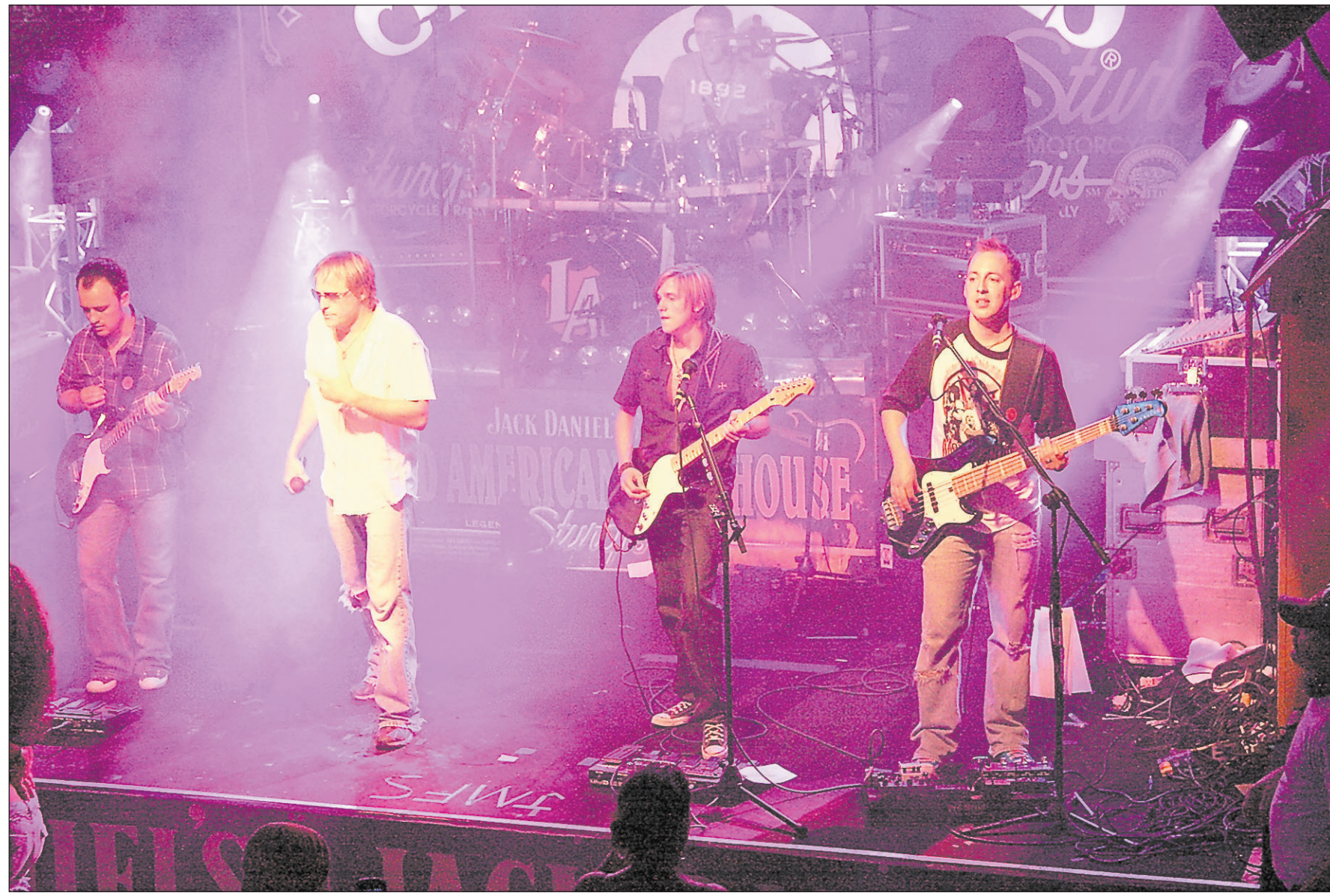
The band Judd Hoos performs tonight (Friday) at Riverboat Days. It is the band's first appearance in Yankton. Judd Hoos takes the stage at 8 p.m.