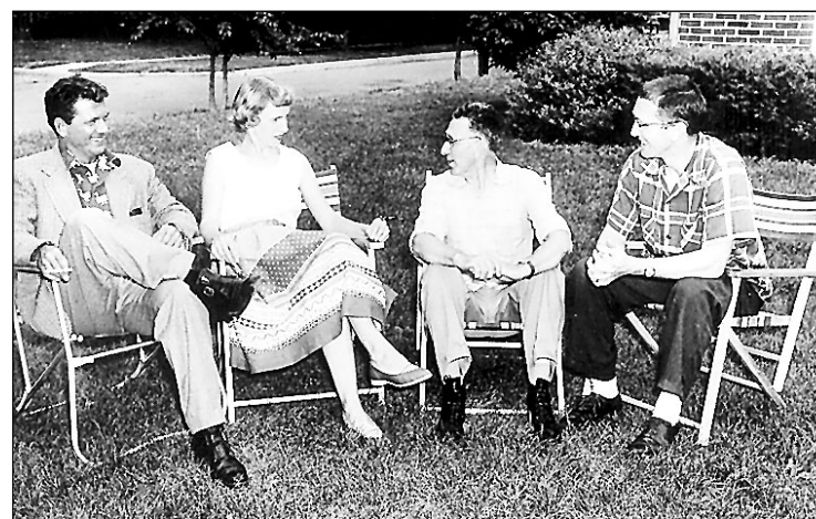
Do you recognize this photo? The Dakota Territorial Museum has a number of files of unknown photographs in the museum archives and seeks your help in identifying those photos. If you would like to view the unidentified photographs file at the museum, call the museum and make an appointment with Crystal. The museum is open 7 days a week from noon-4 p.m. Admission is free. The Dakota Territorial Museum is owned and operated by the Yankton County Historical Society. For more information or to identify this photograph, call 665-3898.