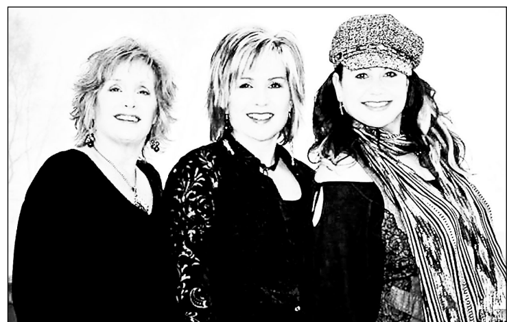
The vocal trio Girlfriend performs at the Dakota Theatre in downtown Yankton at 2 p.m. Saturday in conjunction with this weekend's Riverboat Days celebration.