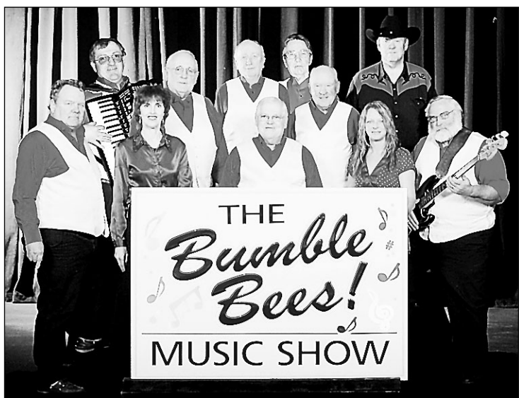
The Bumble Bees perform during the Wagner Labor Day Celebration's Polka Day on Monday, Sept. 6.