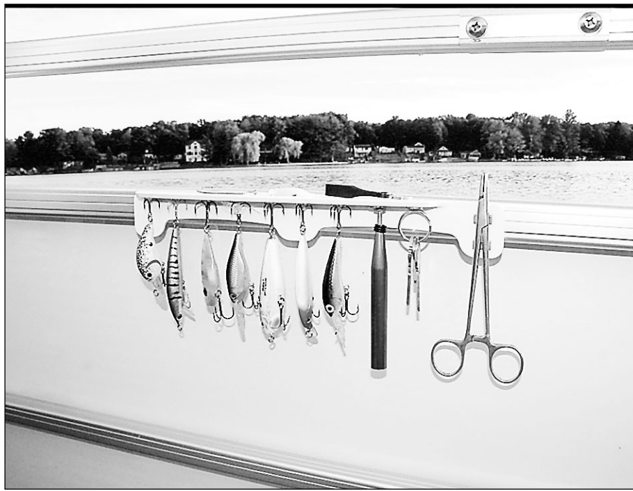
This magnetic lure and tool holder keeps your crankbaits, jigs and pliers within easy reach. The heavy duty magnets allow you to quickly attach and remove any lure or tool, keeping them in place, no matter what Mother Nature throws at you.

When put together with the new LakeMaster chips, the Humminbird 998c will put you on the spot, helping to make locating structure and fish much quicker and easier.