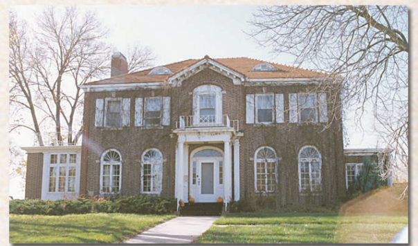
Kabeiseman-Nelson Funeral Home

businesses combined operations and in 1977 the firm officially became known as the the Kostel Funeral Home. Around this time Kostel Funeral Home also began doing the professional work for the operations of the Aisenbery Funeral Home in Menno, which they later purchased. 1978 – Kostel Funeral Home in Yankton moved into the current structure.