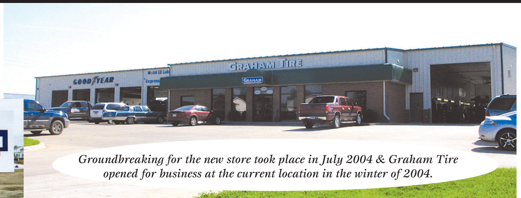
Groundbreaking for the new store took place in July 2004 & Graham Tire opened for business at the current location in the winter of 2004.

www.grahamtire.com • 665-4406 2704 Fox Run Pkwy • Yankton, SD 57078