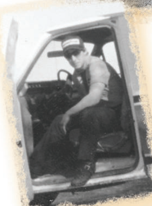
On-Farm Tire Service