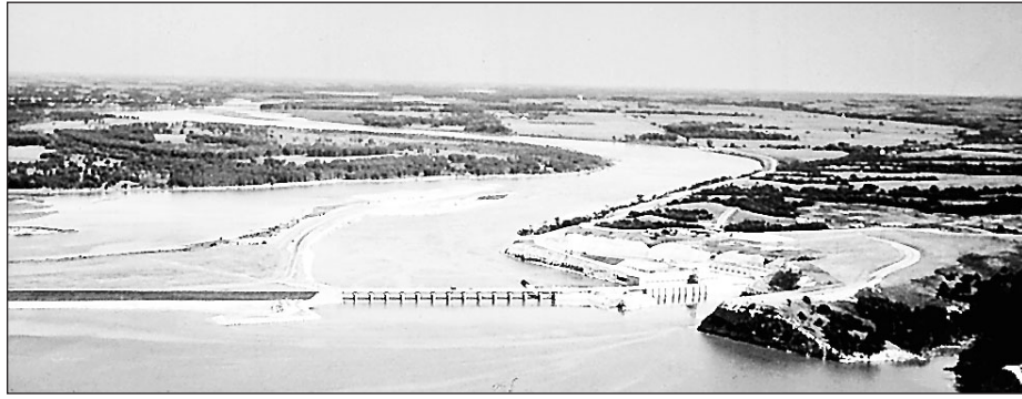
An aerial photo of Gavins Point Dam, circa 1961. The spanning of the river, first by the Meridian Bridge, then by the dam, were among the top stories for Yankton from 1912-1961.

And there are many such stories in practically every family. They are worth seeking