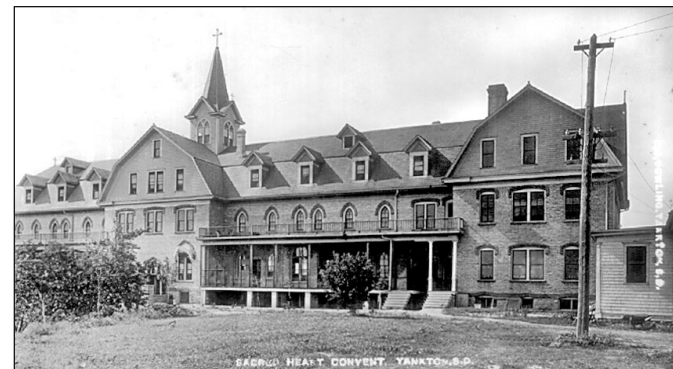
P&D ARCHIVE PHOTOS