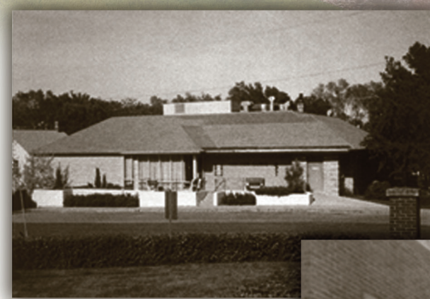
Yankton Clinic located at 400 Park, 1947

We join with Yankton in celebrating 150 years, as well as celebrating over 65 years of care in our region.