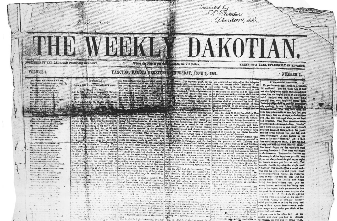
ABOVE: The very first issue of the Weekly Dakotian, published June 6, 1861. It is believed that no original hard-copy versions of that inaugural issue survive, but the full paper can be found on microfilm. BELOW: The Nov. 2, 1889, issue announcing the formation of the state of South Dakota. Typical of the newspaper design practices of the age, the headline you see basically represents a banner headline, with print that jumps out from the sea of gray text and sub-headlines that otherwise filled the paper. Of course, the item is dwarfed next to Jacob Max dry goods front-page advertisement on the right.