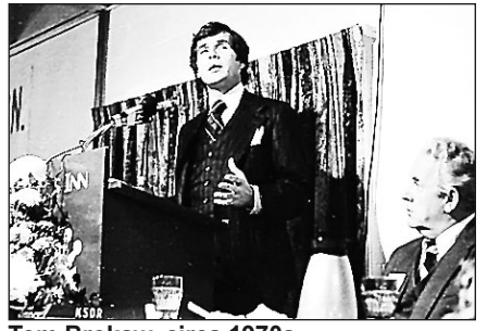
Tom Brokaw, circa 1970s.

BY NATHAN JOHNSON. The estimated value of building permits issued by Yankton County and the City of Yankton decreased in 2008. The estimated value of Yankton County building permits dropped 28 percent to $13.7 million last year. Meanwhile, the city numbers were down slightly from $21.1 million in 2007 to $20.1 million in 2008.