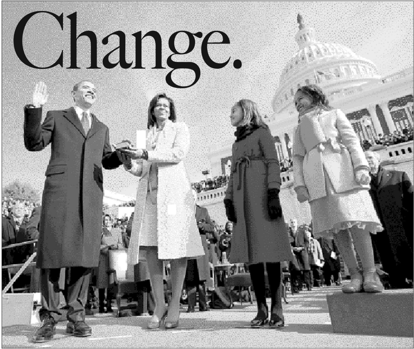
President Barack Obama takes the oath as the 44th U.S. President with his wife, Michelle, by his side at the U.S. Capitol in Washington, D.C., Tuesday. More than a million people crammed into the Washington Mall Tuesday to witness the history-making inauguration.