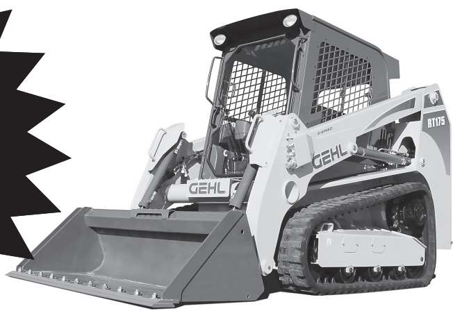
Gehl Track Loader

The manufacturing of the new RT Series, Compact Track Loader began at the Yankton facility in May, 2011.