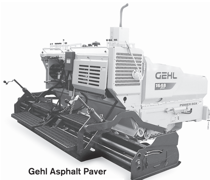
Gehl Asphalt Paver