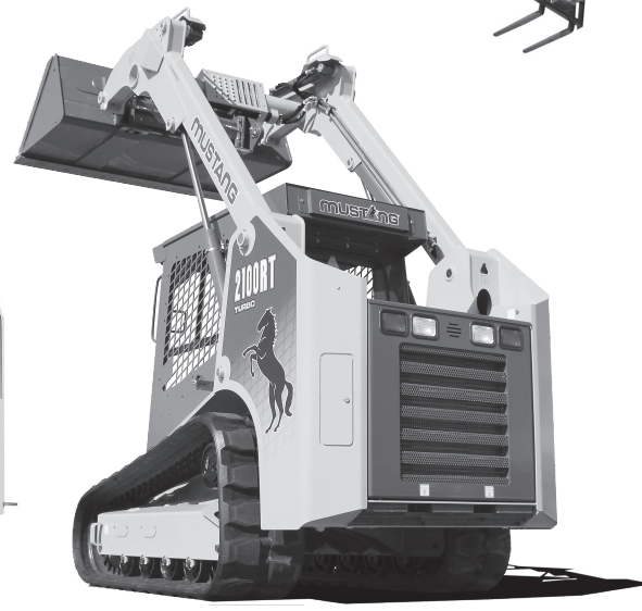
Mustang Track Loader