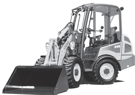
Gehl Articulated Loader - Production started in 2008