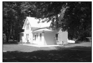
100 Finnotti, Mission Hill $55,500 New Listing

Very well cared for home, 3-bedroom, 1-bath, main floor laundry, detached single garage+shed, well-maintained 100x150 corner lot, just minutes from Yankton, Leona Sparks, (605)660-6078, Anderson Realty