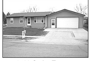
2400 Cedar Terrace $129,000