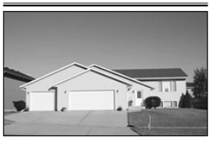
2815 Francis $174,900