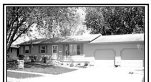
206 Golf Lane * $115,000

One owner home-built '94, 3-bedroom, 2-bath, Chuck's Kitchen cabinets, mainfloor laundry, unfinished basement (egress), insulated/heated garage, fenced lot/sprinkler system, Leona Sparks, (605)660-6078, Anderson Realty