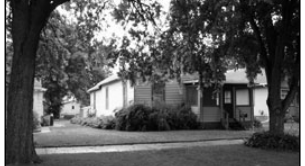
510 Linn * $70,900

2-bedroom, 1.75 bath, main-floor laundry, wood floors, double garage, finished basement $113,500. Joe, Americas Best Realty (605)661-7264