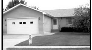
640 Augusta Circle $139,900

New twin home. Quality built, no step design. Beautiful hardwood. 2-bedroom, 2-bath, laundry on main. HOA. List Construction (605)661-8003.