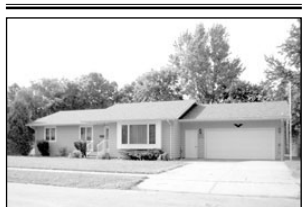
1405 Ash St. $114,900, New listing

One owner home-built '94, 3-bedroom, 2-bath, Chuck's Kitchen cabinets, mainfloor laundry, unfinished basement (egress), insulated/heated garage, fenced lot/sprinkler system, Leona Sparks, (605)660-6078, Anderson Realty