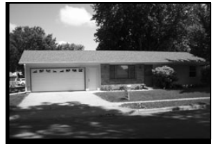
1012 E. 15th * $125,000

Very well cared for home, 3-bedroom, 1-bath, main floor laundry, detached single garage+shed, well-maintained 100x150 corner lot, just minutes from Yankton, Leona Sparks, (605)660-6078, Anderson Realty