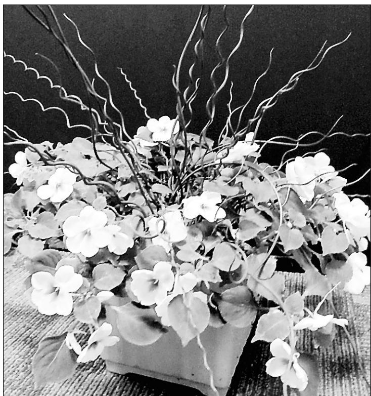
Arrangement By Betts Pulkrabek