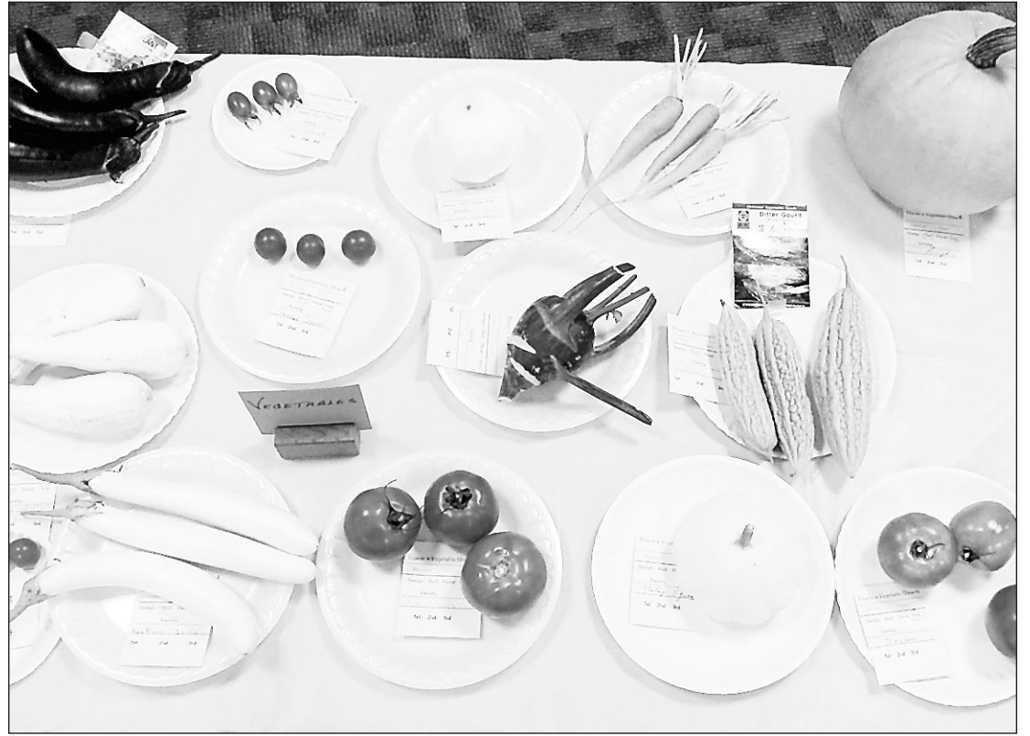
Vegetable Horticulture Table of entries