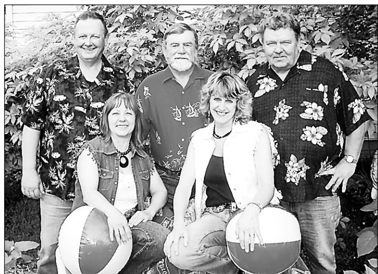
The OutBack Band is the featured musical act at the Riverboat Days main stage in Yankton Sunday afternoon.