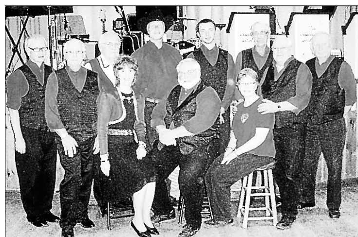
The Bumble Bees perform at the Fort Randall Casino near Pickstown tonight (Friday) and Saturday.

AUG. 19 — The Answer Team at Slowdown, Omaha, Neb., 9 p.m. AUG. 19 — Yesterday and Today at The Waiting Room, Omaha, Neb., 9 p.m. AUG. 19 — Carnival of Madness — featuring Theory of a Deadman, Alter Bridge, Black Stone Cherry, Adelitas Way and Emphatic — at Harrah's Council Bluffs/Stir Cove, 5:45 p.m. AUG. 19-20 — The Clay Creek Deaf Cowboy Band at the Sioux Falls VFW. AUG. 20 — The OutBack Band at Grand Falls Casino, Larchwood, Iowa, 1-5 p.m. AUG. 20 — Keith Urban at the Qwest Center, Omaha, Neb. Tickets: Call (800) 745-3000 or visit www.ticketmaster.com . AUG. 21 — Bret Michaels at Grand Falls Casino Resort, Larchwood, Iowa, 7 p.m. Tickets: Call (712) 777-7777 or visit www.Grand-FallsCasinoResort.com . AUG. 21 — All Time Low at Sokol Auditorium, Omaha, Neb., 7 p.m. AUG. 21 — The Slowpokers at The Waiting Room, Omaha, Neb., 8 p.m.