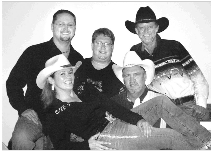
The Clay Creek Deaf Cowboy Band performs at Cheers Bar and Grill in Yankton Sept. 9.