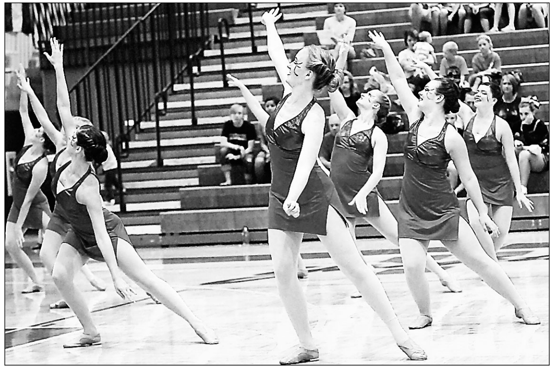
GAZELLES: Yankton Dance Team 2010 Jazz Routine