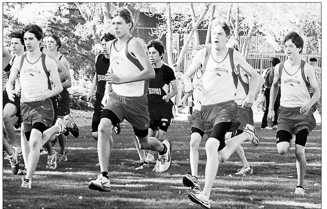
TANAGERS: 2010 Vermillion Boys' Team

"I told the girls that they can achieve whatever they believe they can do, I think if we make it to the state tournament we can win our first round," he said. "We are looking to where we are going to be at the end of the season."