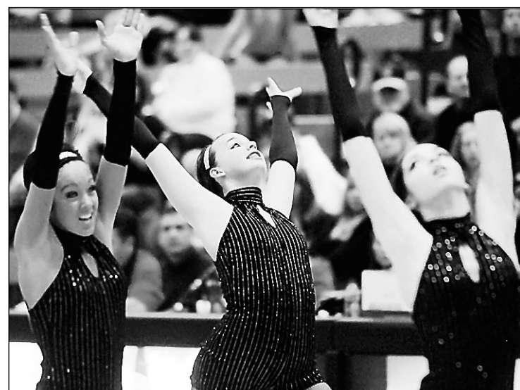
DAKOTA VALLEY: 2010 Dance Team Jazz Routine