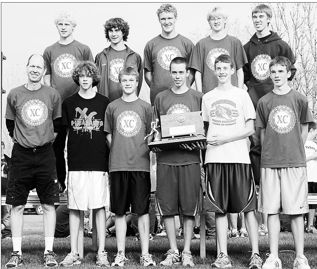
PARKER: 2010 Class B State Championship Team