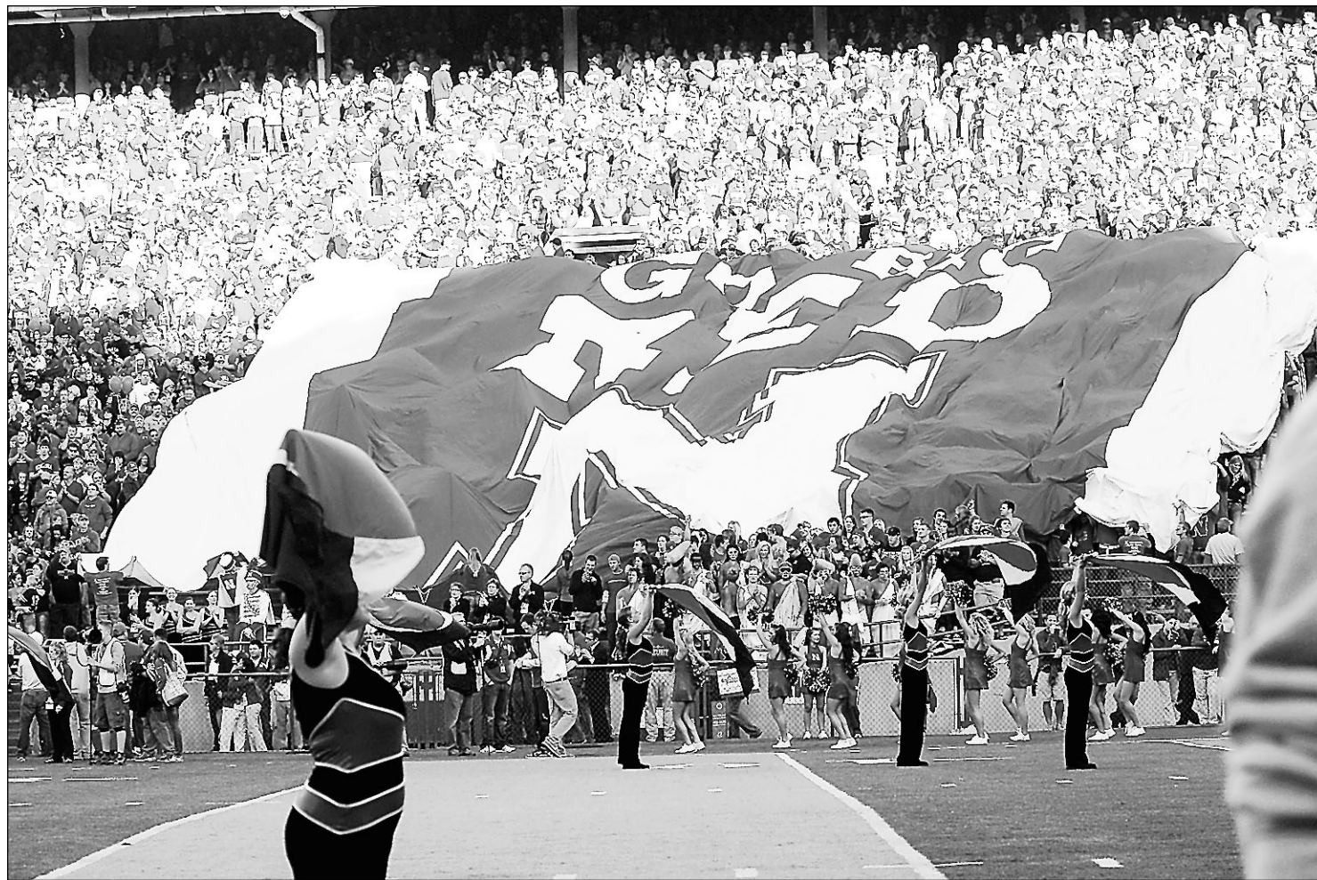
HUSKERS: Nebraska Football Pregame