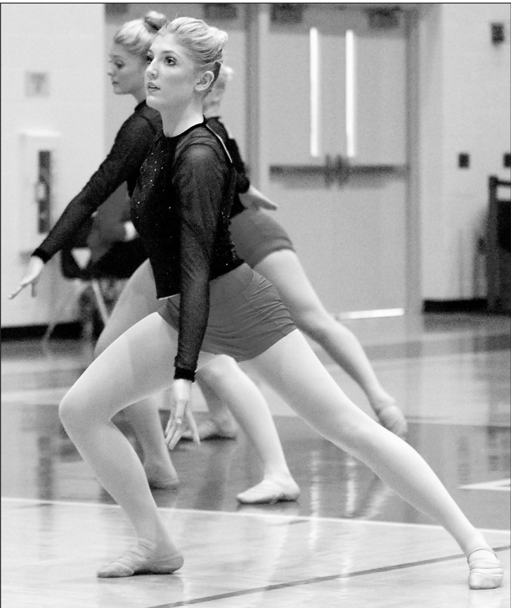
GAZELLES: 2011 Yankton Dance Team Jazz Routine