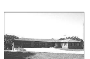
258 Dayton Lane - Tabor $279,000

4-Bedroom, 2-full bath, 1881 square feet, 2+ car garage. (605)660-7537 www.yankton.net/app/html/204brown/