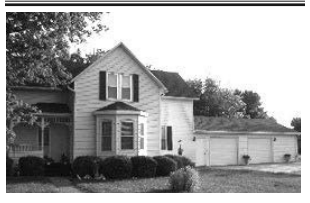
204 Brown St., Gayville For Sale by Owner $137,000

4-Bedroom, 2-full bath, 1881 square feet, 2+ car garage. (605)660-7537 www.yankton.net/app/html/204brown/