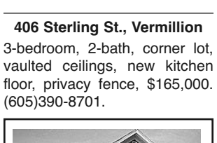
406 Sterling St., Vermillion