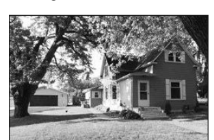
136 E. Turner - Irene

Open floor plan, great for entertaining. 3-bedrooms possible 4th. Above grade lower level family room, fenced yard, energy efficient heat pump. (605)760-5670 http://www.yankton.net/app/html/106grove/