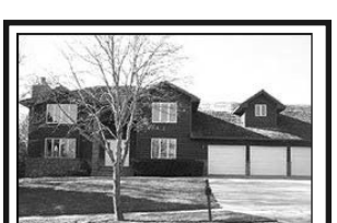
905 W. 13th St.

2 bedroom, 1-1/2 Bath, single garage. Stacy Schramm, Century 21, $65,000. (605)660-3332.