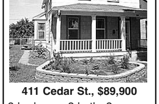
411 Cedar St., $89,900

3-bedroom, 2-bath, corner lot, vaulted ceilings, new kitchen floor, privacy fence, $165,000. (605)390-8701.