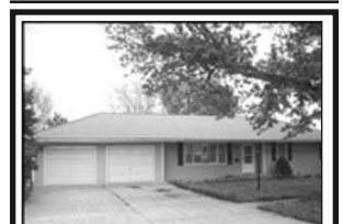
1009 1st St. - Crofton