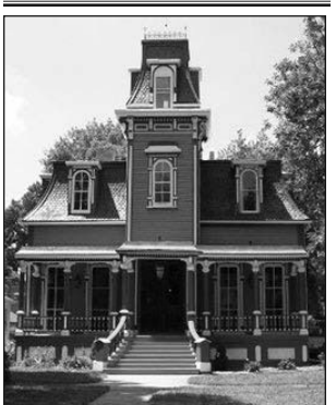
517 Mulberry - $295,000

Magnificent 5-bedroom 6-bath home with 4-fireplaces and gorgeous upscale kitchen! Ginny, Discovery Realty, LLC (605)661-6031.