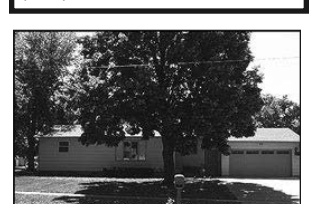
1011 W. 12th