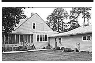
30358 448th Ave., Volin

4-bedroom, 2-bath, 2-car attached garage, fenced yard. Call (605)464-1722. http://www.yankton.net/app/html/3015nfrancis/index.html