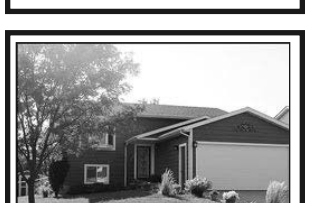
3015 N. Francis Street

Ranch style 5-bedroom, 3-bath 2-car garage. Finished basement, many updates. (605)760-0740; (605)760 0149 http://www.yankton.net/app/html/2806mary/