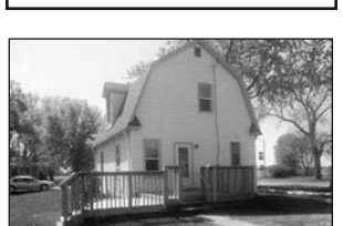
412 Brown - Gayville