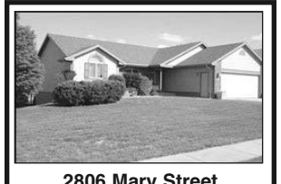
2806 Mary Street

3-bedroom, 3-1/2 bath, 3-car garage. Attached 1-bedroom apartment. BY Water & cistern, many extras, farmland available. Call (605)891-8988 (605)660-2832 http://www.yankton.net/app/html/258dayton/