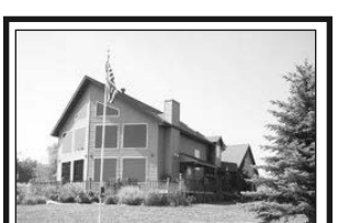
Lewis & Clark

Charming Yankton Home near Library & schools. Heated insulated 2-car garage/workshop. Storage shed; possible upstairs rental. Details (605)665-0954.