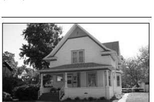
606 Capital - $131,900

Magnificent 5-bedroom 6-bath home with 4-fireplaces and gorgeous upscale kitchen! Ginny, Discovery Realty, LLC (605)661-6031.