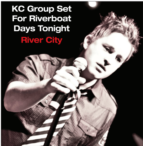
KC Group Set For Riverboat Days Tonight River City