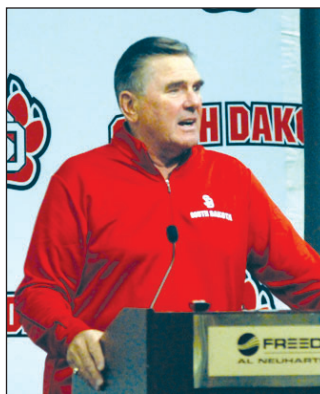
Media Day A Scene Of Hope For USD • 6A