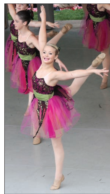
Bodies were flying throughout Riverboat Days. LEFT: A rider has a tough timing hanging on during the Riverboat Days Extreme Bull Riding Event. This year's event, which brought in a large crowd, drew 40 riders from across the country. ABOVE: A dancer from the Academy of Dance shows a lot of grace during Friday's performance. To see or purchase images from Riverboat Days, visit spotted.yankton.net.