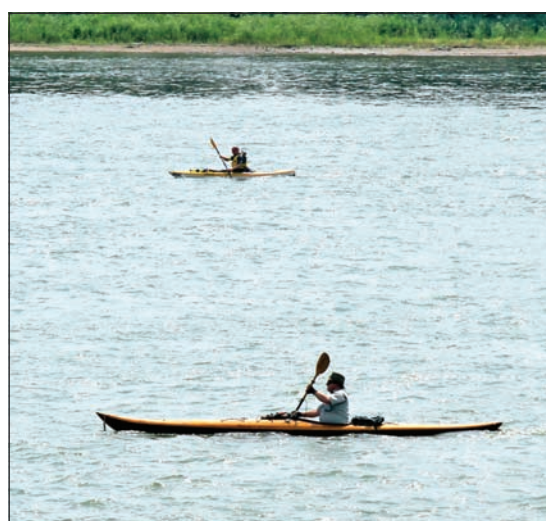
ABOVE: Riverboat Days also had some action on the Missouri River that flows in front of Riverside Park, courtesy of the inaugural Riverboat Days Kayak Run. The event started near Gavins Point Dam and went down to Paddle Wheel Point, located east of Riverside Park.