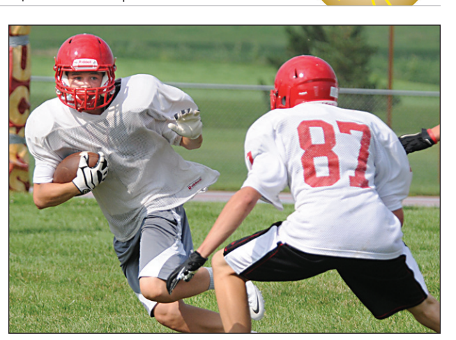
Bucks Focused On Success As Drills Ramp Up • 8