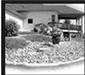
Custom Curbing Co.

Continuous concrete landscape borders using technology and beauty to enhance lawns, gardens, driveways. (605)665-4582.