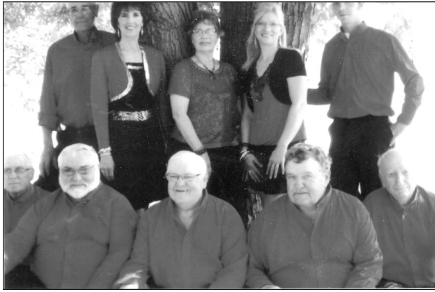
The Bumble Bees perform at the South Dakota State Fair (Dakotaland stage) in Huron Aug. 29-30.