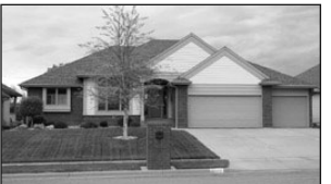
2707 Lakeview * $395,000

Golf course ranch home. 4 bedroom, 3 bath, 3 car garage. (605)760-5604.