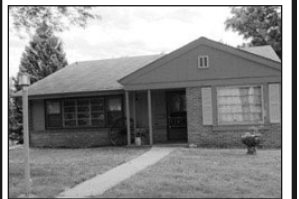
309 E. 9th Reduced $114,900

4-bedroom, 2-bath, 2-car attached garage, fenced yard. Call (605)464-1722. http://www.yankton.net/app/html/3015nfrancis/index.html