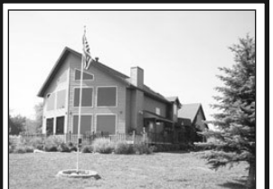
Lewis & Clark Lake View Home 43409 Kaiser Road

Updated Broadway frontage building, 16 office units. (605) 661-8643 Carla @ Century 21