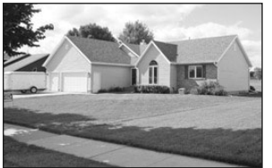
2605 Mulligan Drive $257,500

4-Bedroom, 2-full bath, 1881 square feet, 2+ car garage. (605)660-7537 www.yankton.net/app/html/204brown/