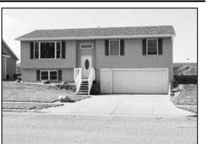
641 Augusta $169,500

Cheaper than rent! Remodeled 4-bedroom home with several updates, new kitchen/bath, double stall garage. A must see! Call Kami Guthmiller (605)660-2147 Lewis and Clark Realty.