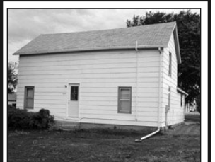
1610 Oak • Tyndall

1-1/2-story, 5-bedrooms, 3-1/2 baths, 3-car garage, many updates, corner lot in Summit Heights. (605)760-3561 for viewing or more information http://www.yankton.net/app/html/1300w17th/