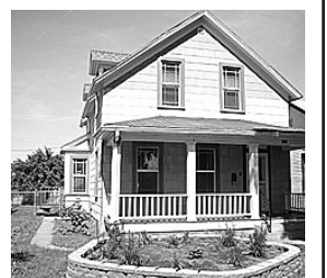
411 Cedar St., $89,900