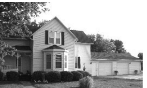
204 Brown St., Gayville For Sale by Owner $137,000

2+ bedroom on large corner lot. Near downtown, $22,777. Call Emma, Century 21 (605)661-2224.