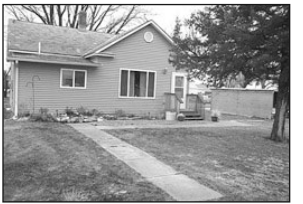
108 W. 22nd • Tyndall $54,900

Open floor plan, great for entertaining. 3-bedrooms possible 4th. Above grade lower level family room, fenced yard, energy efficient heat pump. (605)760-5670 yankton.net/106grove