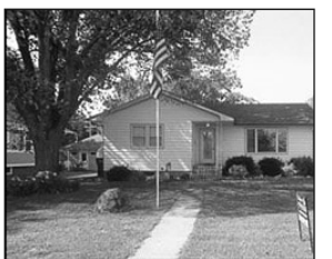
410 Meckling Gayville • $129,900

4-Bedroom, 2-1/2 bath, 2-car attached garage. Located 5 minutes from town on 8.5 acres. Too many updates to list. Call for details (605)661-2885.