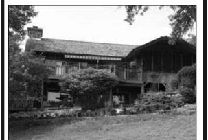
137 Sleepy Hollow Dr. $540,000

Move in ready, 2-bedroom ranch with new ceramic tile in bathroom and kitchen. Granite countertops, newer plumbing and new furnace. (605)660-0618 Bill Conkling, Lewis & Clark Realty.