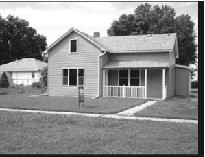
418 West 2nd St. Yankton $99,900