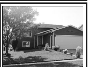
3015 N. Francis Street Price Reduced * $160,000