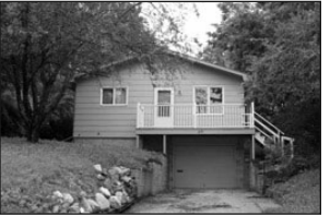
804 Pine • $105,000

Wonderful 4-bedroom, 3-bath home, oversized garage, fenced yard, great neighborhood. Erica (605)660-2992 Discovery Realty.