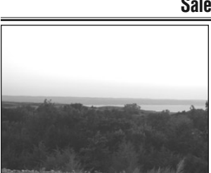
4.69 Acres 301St-Colony Road $77,500

Mobile home, double wide, #10, 2200 Douglas, three bedrooms. Cash sale. (605)668-0943.