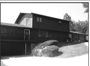
117 Gavins Place $229,000

Shipping crates for sale/rent 20'x8', and Climate controlled storage, 5'x5' up to 10'x15' (605)660-0305.