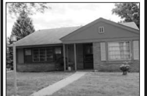
309 E. 9th Reduced * $114,900