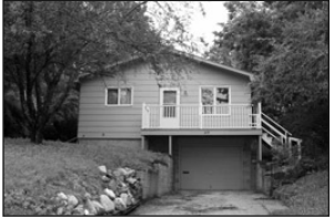
804 Pine • $105,000

Wonderful 4-bedroom, 3-bath home, oversized garage, fenced yard, great neighborhood. Erica (605)660-2992 Discovery Realty.