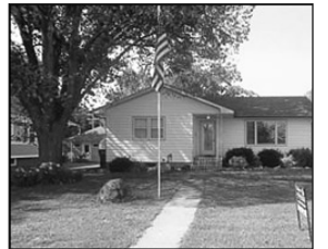
410 Meckling Gayville • $129,900

4-Bedroom, 2-1/2 bath, 2-car attached garage. Located 5 minutes from town on 8.5 acres. Too many updates to list. Call for details (605)661-2885.