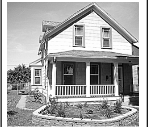
411 Cedar St., $89,900