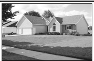
2605 Mulligan Drive $257,500

Golf course ranch home. 4 bedroom, 3 bath, 3 car garage. (605)760-5604.