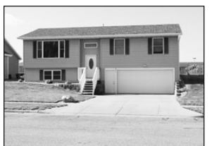
641 Augusta $169,500