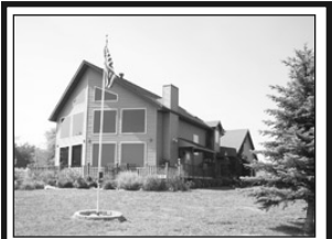
Lewis & Clark Lake View Home

America's Best Realty LLC is now located at 1901 Broadway. (605)260-1600 "Unlock The American Dream!