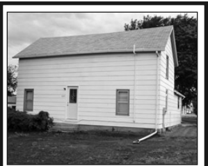
1610 Oak • Tyndall

Lake home, wrap around deck, lake view. 3-Bedroom, 1-1/2 bath, 4-stall garage. Max Payne, Anderson Realty, LLC (605)661-8434.