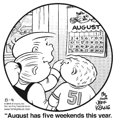
"August has five weekends this year. That means we get to take a really long vacation."