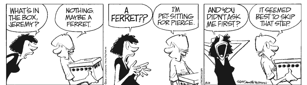
ZITS | JERRY SCOTT AND JIM BORGMAN