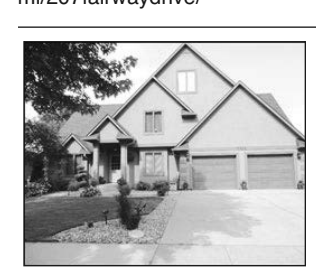
2308 Burleigh Reduced • $329.900

Over 3,200 sq.ft! kitchen/carpet. 2-large bedrooms on main level, 2-potential bedrooms on lower level. 3-full baths, XL-garage. (605)661-8497 (605)661-8378. http://www.yankton.net/app/ht ml/207fairwaydrive/