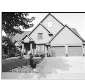
2308 Burleigh NEW PRICE REDUCTION: $319,900

117 Lookout Trail • $459,900 Gorgeous Jim River view, 5-bedroom. 4-bath executive home. Stacy, Century 21, (605)660-3332.