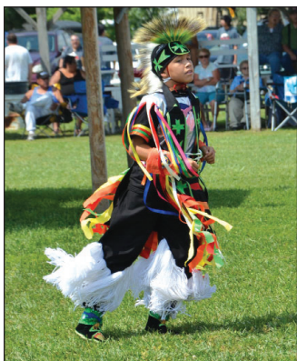
Ponca Powwow Set • 1B