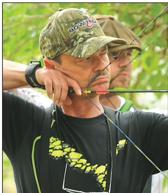
Archery Tourney Continues • 6A